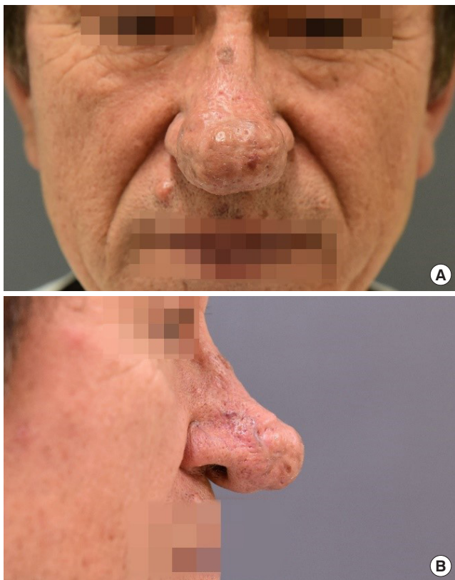
Fig. 1. Preoperative state frontal view (A) and lateral view (B).