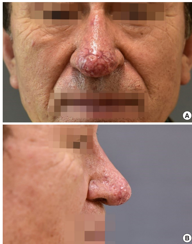
Fig. 3. Postoperative state (8 weeks) frontal view (A) and lateral view (B).