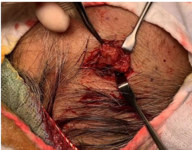
Fig. 1. Photograph of the intraoperative finding. An irregularly shaped mass with heterogeneous high vascularity was found in the temporalis muscle and attached to the periosteum.