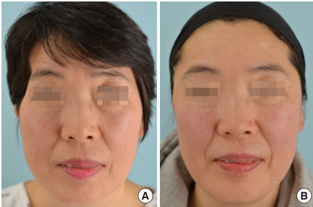
Fig. 2. A 48-year-old woman with a postoperative depression deformity on the temple received correction with bilateral silicone implant insertion. (A) Preoperative and (B) 9-month postoperative photographs.