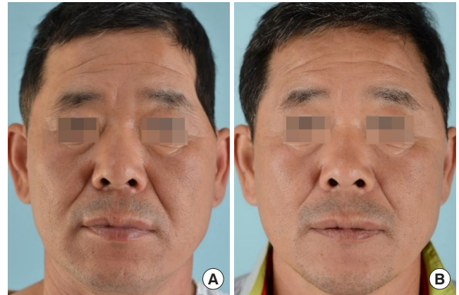
Fig. 3. A 51-year-old man with a postoperative depression deformity on the temple. The left side was corrected by silicone implant insertion. (A) Preoperative and (B) 4-month postoperative photographs.

Autologous reconstruction has long been considered the best reconstruction method due to its excellent osteoconductive properties; however, inadequate donor site mobility and an insufficient extent of tissue harvesting are limitations of this technique. Therefore, other methods, such as bone allografts, bone morphogenetic proteins, and synthetic graft materials, are often used as alternatives. Morphogen-enhanced bone graft substitutes have shown similar success rates and equivalent quality of regeneration, but their price remains relatively high [10]. In 2020, Choi et al. [11] introduced a method of reconstruction using dermofat grafts from the groin to correct acquired facial deformities. However, the groin, as a donor site, does not yield a sufficient amount of tissue for large temporal hollowing deformities. In recent years, alloplastic reconstruction has been widely used as a technique with proven biocompatibility that overcomes the shortcomings of autologous reconstruction. Titanium is the oldest alloplastic material. Its biocompatibility has been extensively demonstrated [12], and it has high mechanical strength and therefore excellent stability; however, further intraoperative adaptation of a titanium implant is extremely difficult. Other alloplastic materials such as glass-ceramics, polymethyl-methacrylate [13], hydroxylapatite [14], and polyetheretherketone can be used [5], but their disadvantages include the possibility of infection, breakage, and thermal damage