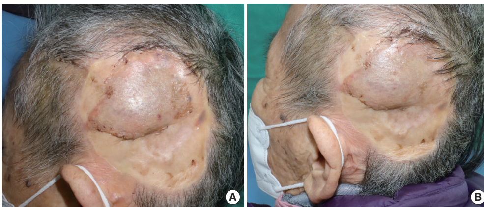
Fig. 4. Postoperative photographs at 5 weeks (A) and at 2 months (B).

months after surgery, the wound has healed well (Fig. 4). The reconstruction was successful without any significant complications. The facial nerve branches were preserved well, and functional conservation was confirmed in her facial expression. When she furrowed her eyebrows, closed eyes and smiled lifting the lip corners, symmetric facial expression was demonstrated. Cautious dissection and turn-over procedures posterior to Pitanguy's line (PL) prevented unintended injuries of facial nerve branches. The bulky tissue above the skull effectively provided a protective effect.