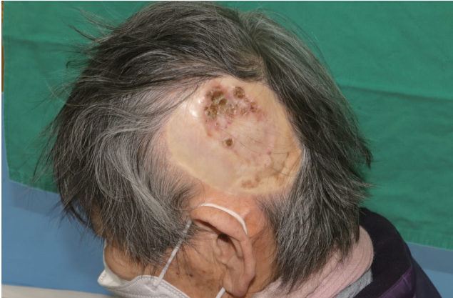
Fig. 1. Preoperative photograph. Bone exposure is observed at the previous split-thickness skin graft site.

to reconstruct the defect in order to provide adequate soft tissue between the bone and skin.