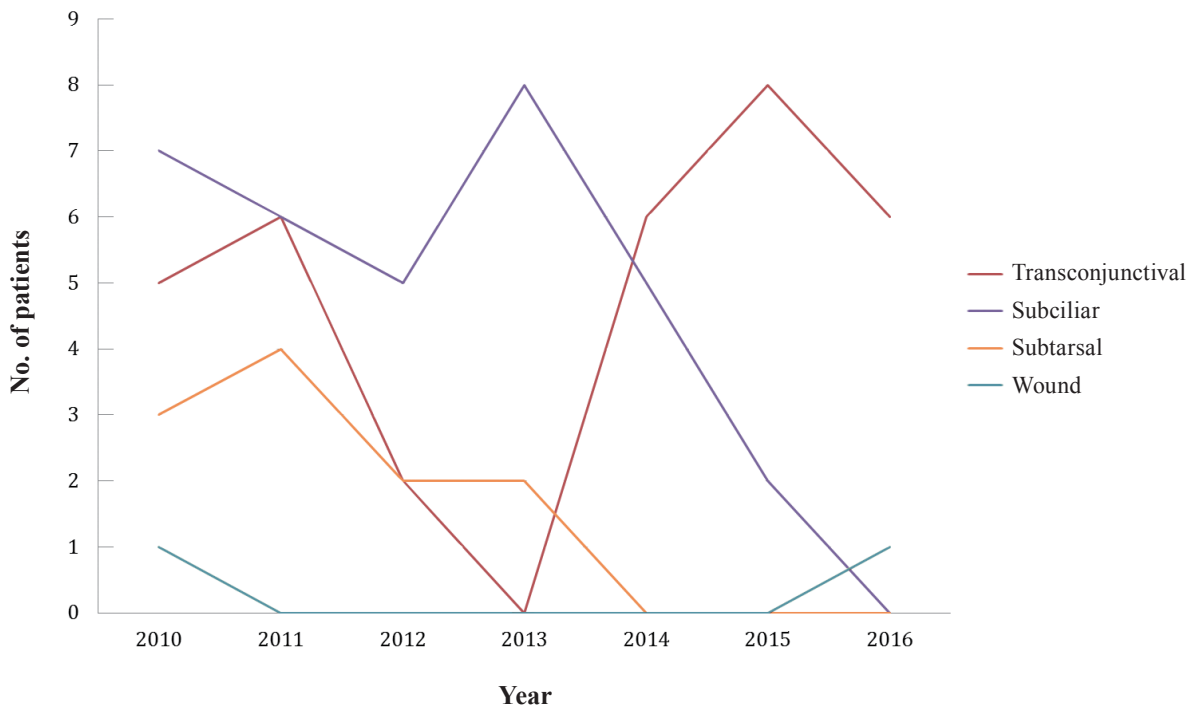
Fig. 2. Evolution of the surgical approach used during the study period.

Diplopia was observed in 24 patients (39%) in the immediate postoperative period. Three patients (13%) had enophthalmos 3 months after surgery. Seven patients (29%) complained of infra-orbital hypoesthesia for more than 90 days after surgery. Eight patients (10%) experienced a retractile scar including entropion and ectropion, resolved by local treatments (Table 4). Two patients reported discomfort associated with the use of bioresorbable im-