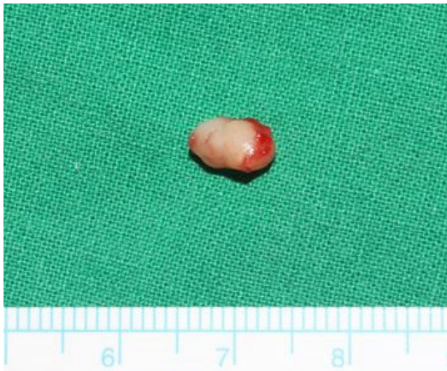
Fig. 1. Gross inspection of ectopic pleomorphic adenoma. It showed soft, firm, and rubbery characteristics.

ological examination revealed a pleomorphic adenoma which contains mixed epithelial and myoepithelial cells with duct-like structures (Fig. 2).