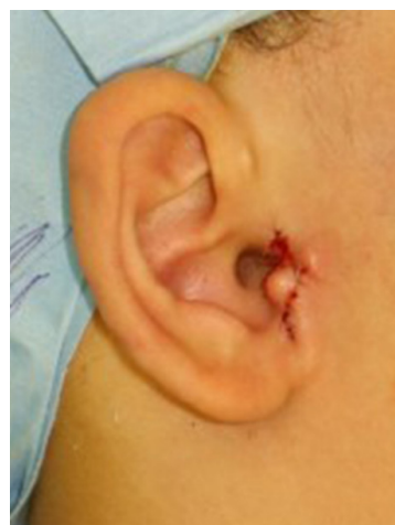
Fig. 3. Immediate postoperative view.

The patient returned for follow-up and was content with the improvement at 2 months postoperatively (Fig. 4).