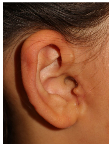
Fig. 4. Two-month postoperative view.