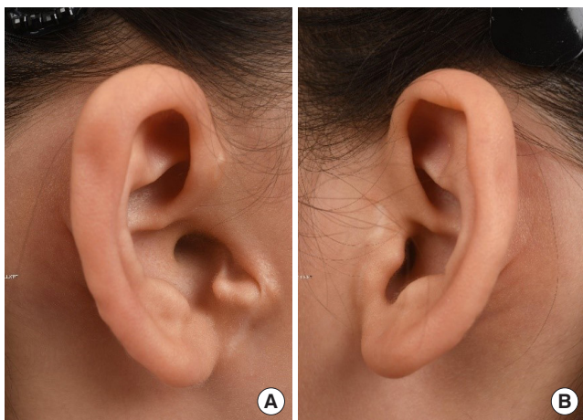
Fig. 1. An 11-year-old girl presented a tragal malformation of right ear, showing a deformed small horizontally lying cartilage. (A) Right ear. (B) Left ear.

A single-stage reconstructive procedure with a transposition technique using a chondrocutaneous flap was performed. A C-shaped incision (Fig. 2, a) around the horizontally lying pre-existing cartilage was made and dissection was performed towards the proposed tragus and a posteriorly based pre-existing cartilage flap was created. The subcutaneous soft tissue and remaining cartilaginous portion were preserved to reconstruct the tragus. This composite flap was transposed 90° upwards using the posterior part of the flap as a pedicle.