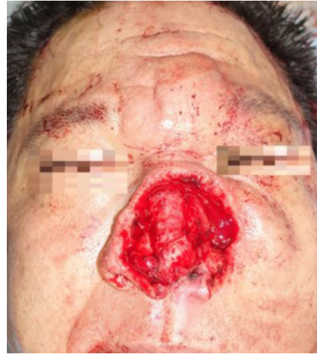
Fig. 3. Intraoperative clinical photograph. The resection resulted in an exposure of bilateral upper lateral and lower lateral cartilages. The defect involved the whole of columella, nasal tip, and left ala. The defect also affected a part of the nasal dorsum and left cheek.

The mass was carefully resected under general anesthesia. The resection resulted in an exposure of bilateral upper lateral and lower lateral cartilages (Fig. 3). The defect involved the whole of columella, nasal tip, and left ala. The defect also affected a part of the nasal dorsum and left cheek. Two flaps, the paramedian forehead flap based on the right supratrochlear artery and the