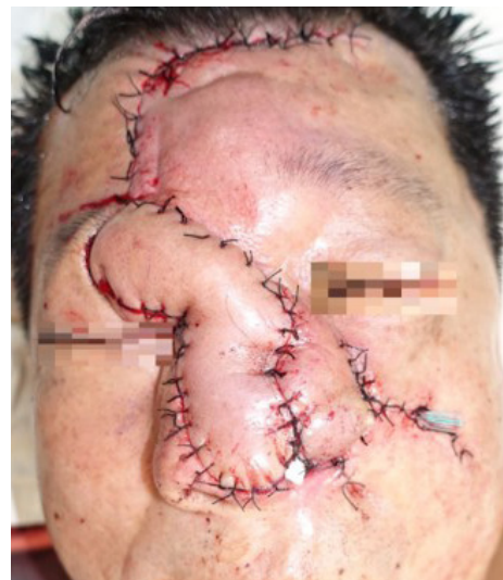
Fig. 4. Immediate postoperative clinical photograph. The paramedian forehead flap based on the right supratrochlear artery and the nasolabial rotation flap from the left side were utilized to cover the defect.

nasolabial rotation flap from the left side, were utilized to cover the defect (Fig. 4). The two donor sites were closed primarily without remarkable disfigurement. The forehead flap was divided 4 weeks after the first operation. Minor surgical refinements were also made with the flap division. Before closing the proximal wounds, excessive soft tissue around the split-site was carefully removed to achieve a good postoperative shape. A wedge resection of the left alar base area was done to correct the superiorly displaced alar. The patient showed good aesthetic results, without any complication or recurrence for 10 months