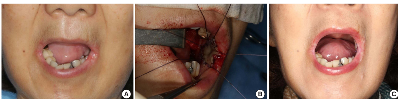
Fig. 2. Microstomia with perioral scar contracture due to caustic soda. Malnutrition and dental caries were found. The temporomandibular joints were mobile. (A) Preoperative photograph (mouth opening: 21 mm, intercommissure distance: 36 mm). (B) Scar release and full-thickness skin graft (4.5×2 cm sized) on the left buccal mucosa. (C) Postoperative improvement of the opening of the mouth (mouth opening: 26 mm, intercommissure distance: 36 mm).

three cases of triangular excision of mouth corner that was covered with a buccal mucosal advancement flap (n = 3) (Figs. 1, 2).