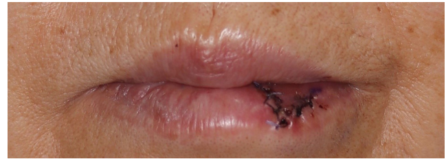
Fig. 3. Clinical photograph taken on postoperative day 3.

The lips are the starting point of both the gastrointestinal and respiratory systems. Moreover, they are highly visible structures, and an elaborate lip contour defined by structures, such