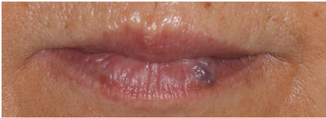
Fig. 1. Clinical photograph of the patient taken on the first day of consultation in the hospital shows a mass measuring 0.7×0.7 cm on the left lower vermilion adjacent to the white roll.