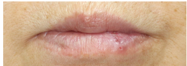
Fig. 4. Clinical photograph taken on postoperative day 7 shows healing of the lesion without distortion of the vermilion.