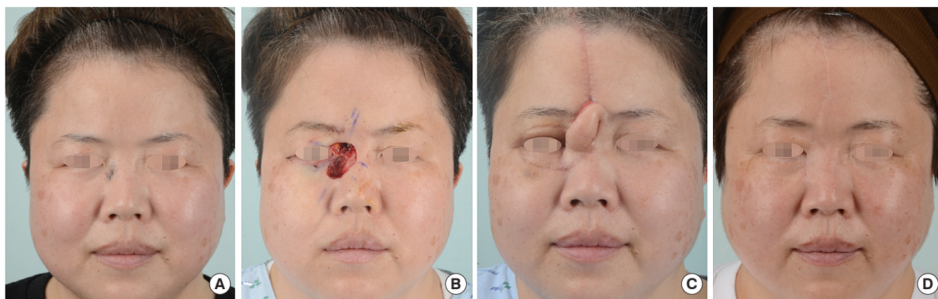
Fig. 1. A 48-year-old woman, whose primary diagnosis was nevus, was finally diagnosed as basal cell carcinoma. (A) Preoperative photograph. (B) Intraoperative photograph after excision of the tumor. (C) Reconstruction using an orbicularis oculi musculocutaneous advancement and a forehead flap. (D) Follow-up photograph 1 year and 6 months after surgery.

Responses were assessed on a 5-point scale for each item (1 = very dissatisfied, 2 = dissatisfied, 3 = fair; 4 = satisfied, 5 = very satisfied) and total score is out of 15. OOMC, orbicularis oculi musculocutaneous flap.